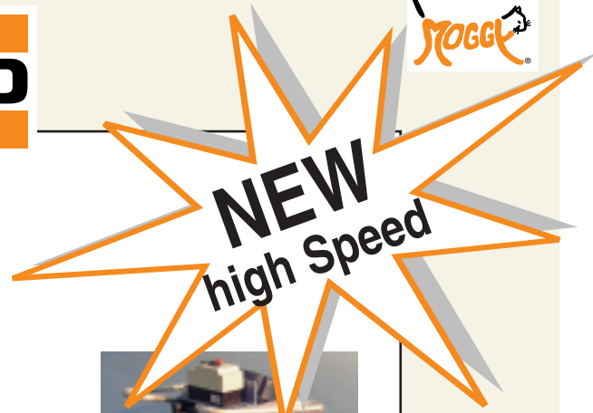
Plate Edge Bevelling Machines

...for bevelling the under-side of plate